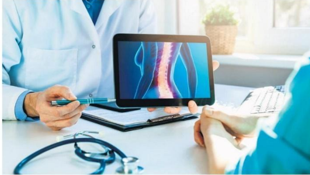
Patient Safety Enhanced with Launch of Karnataka's Patient Advisory Council in Hospitals